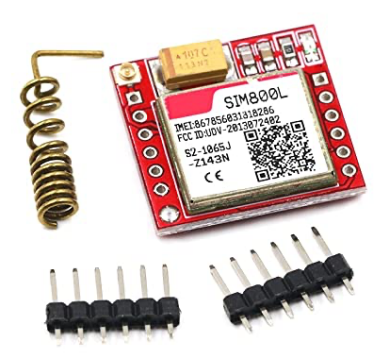
Figure 5: SIM800L GPRS GSM Module

3.3 PZEM-004T Power Monitoring Module: A power measurement module capable of monitoring voltage, current, power, and energy consumption. The PZEM-004T (Fig 4) provides accurate readings, making it essential for real-time energy monitoring applications, ensuring efficient power management in smart systems and used for recording power usage in our system