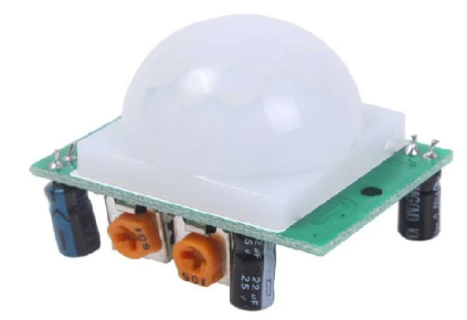
Figure 7: Winsen ZRD-09 PIR Sensor

3.5 4 Channel Isolated Relay Module: This module contains four high-quality relays that can control up to 250V at 10A per channel(Fig 6). It provides isolation between the microcontroller and the high-power load, ensuring safe operation in controlling appliances and enabling user control over a variety of devices at will.