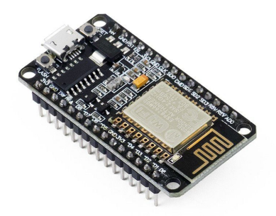
Figure 3: Node MCU ESP 8266

3.1 Arduino UNO R3: The Arduino UNO R3(Fig 2) is a microcontroller board based on the ATmega328P. It features 14 digital input/output pins, 6 analog inputs, a 16 MHz quartz crystal, a USB connection, a power jack, an ICSP header, and a reset button used as the primary microcontroller for the system controlling the Relay and receiving the data from the PZEM-004T and sharing the reported data to the Node MCU Esp 8266.