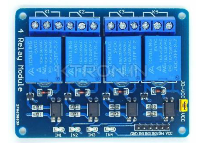
Figure 6: 4 Channel Isolated Relay Module

3.5 4 Channel Isolated Relay Module: This module contains four high-quality relays that can control up to 250V at 10A per channel(Fig 6). It provides isolation between the microcontroller and the high-power load, ensuring safe operation in controlling appliances and enabling user control over a variety of devices at will.