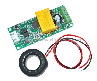
Figure 4: PZEM-004T Power Monitoring Module

3.2 Node MCU ESP 8266: The Node MCU ESP 8266(Fig 3) is a low-cost Wi-Fi microchip with full TCP/IP stack and microcontroller capability. This module allows for the development of Internet of Things (IoT) applications using the Arduino IDE to allow WIFI based control of the system sending and receiving between the web application and Arduino UNO.