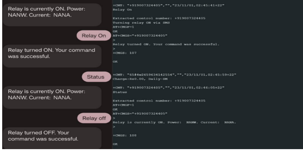
Figure 10: SMS System

The data acquisition from the PZEM-004T Power Monitoring Module, which precisely measures electrical parameters like voltage, current, power, and energy consumption in real-time along with inputs from environmental sensors, is processed by the Arduino UNO R3 microcontroller to identify consumption patterns and anomalies. Based on this analysis, the system generates control signals to adjust power distribution as per preset conditions of ambient light and minimum occupancy, executed via the 4 Channel Isolated Relay Module which in turn is controlled by the Arduino UNO. For remote accessibility, the Node MCU ESP 8266 module offers wireless connectivity, allowing users to monitor and control the system from any location. Additionally, the SIM800L GPRS GSM Module Core provides cellular communication for remote areas lacking Wi-Fi. This enables real-time adjustments to power distribution, significantly enhancing energy efficiency and reducing wastage. Data collected is stored for further analysis to refine power management strategies. The SMS system is shown in Fig 10.