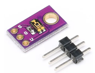
Figure 8: CJMCU-TEMT6000 Light Sensor

3.6 Winsen ZRD-09 PIR Sensor: The Winsen ZRD-09(Fig 7) is a Passive Infrared (PIR) sensor designed for motion detection. By detecting changes in infrared radiation, it can sense human presence or movement, therefore it's used as an occupancy detection system in our system.