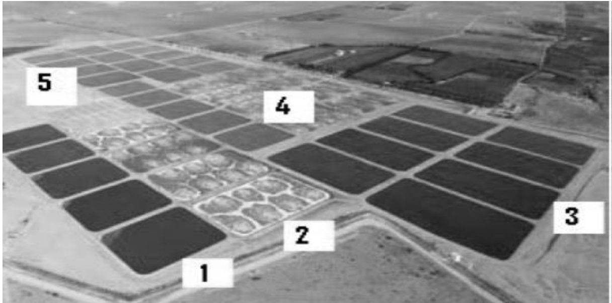
Figure 1: Synoptic diagram of Oujda WWTP. 1- Anaerobic basins; 2- Aerated basins; 3- Maturation ponds; 4- Aerated basins; 5- Drying beds.

Figure 1 shows the different basins that make up the WWTP.