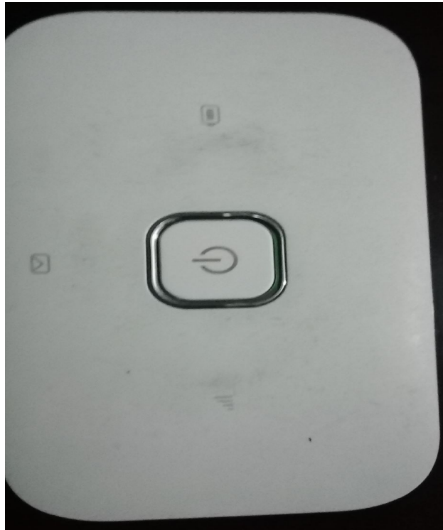
Figure 2: Wireless Modem on Switch On State