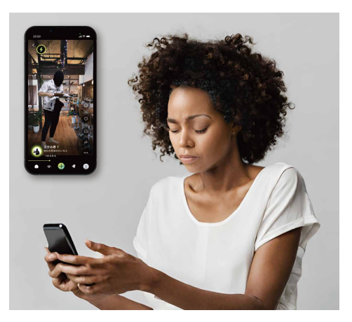
(a) When the user's emotional reaction is neutral.