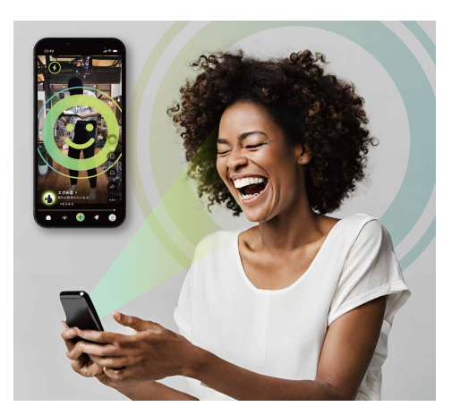
(b) When the user smiles watching content.

Figure 1: User interface and use case of BlitzMe. When users smile watching content on the app, a smile-awareness effect appears on the screen, providing immediate visual confirmation of the detected smile. The content is presented in a reel format, allowing users to swipe vertically to browse through different videos and images seamlessly.