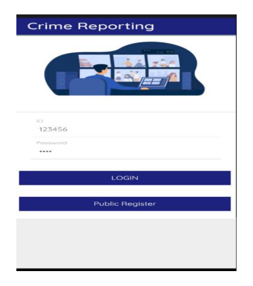
Fig 3.Login Page for Admin, Police and Public Users. Figure 3 shows the Login Page for Admin, Police, and Public Users, providing each user group with secure access to specific system functionalities.