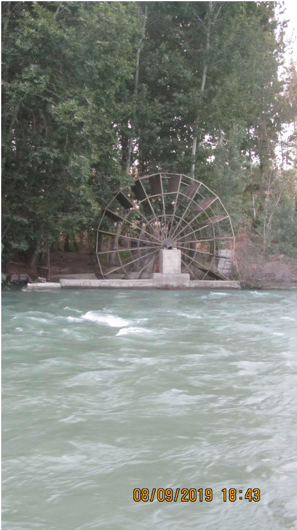
Figs. 15 – 17. Establishing a Hydro - electric wheel for producing new, safe, cheap and renewable energy resources by cooperating and working of some educated and innovative peasantry and small holdings farmers, in 60 Km distance in west of Isfahan city and beside Zayandeh rood river in center of Iran (By author. 2019).