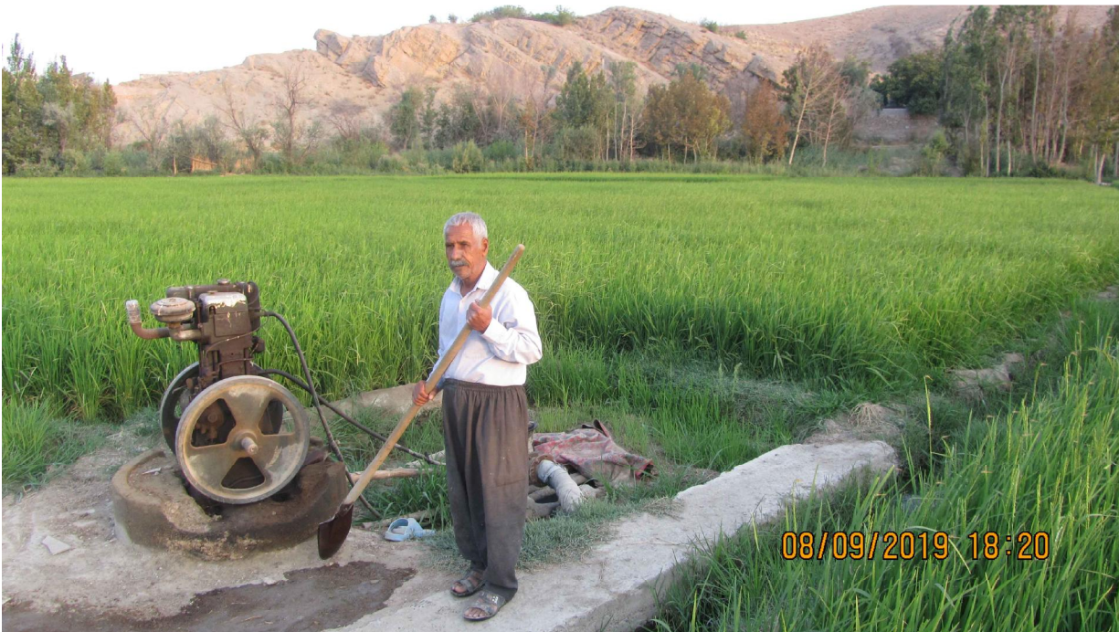
Figs. 1 – 8. Land fragmentation, peasantry and small holdings as major type of agricultural production system in Iran, in 60 Km distance in west of Isfahan city and beside Zayandeh rood river in center of Iran. (By author. Spring and summer, 2019).