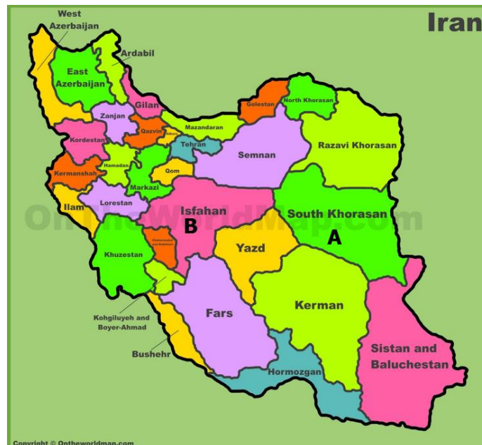
Fig. 14. Map locations of doing this study, A (South Khorasan province, east of Iran) and B (Isfahan province, and beside Zayandeh road river in center of Iran). (Iranian Bureau of Statistics, 2019).

Main challenging factor in land-use conflict studies is the multidisciplinary nature of this issue, and thus, different stockholders from various influential parties are involved. For doing this study utilized qualitative approach with its main tools for gathering information such as participatory observation, discussions, maps, scientific articles, documents and pictures. Main locations of study were rural areas in two provinces in Iran, namely Isfahan and South Khorasan provinces because of accessibility of them for author and also land fragmentation, peasantry and small holdings are more stronger and visible in them. Author utilized various documents such as Iranian and foreign scientific magazines and journals, TV and radio programs, Iranian Bureau of Statistics, discussions with experts, professors and beneficiaries and field research and visits by himself specially in above provinces. In below map, showed locations of this study as A and B. (Please see figures 1-17).