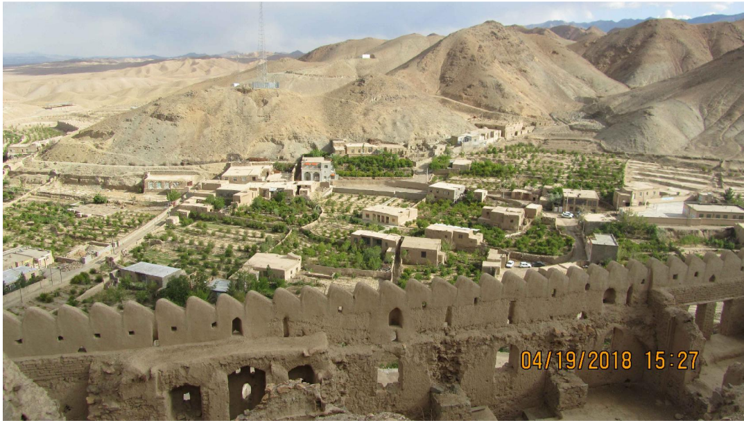
Figs. 9 – 13. Land fragmentation, peasantry and small holdings as major type of agricultural production system in Iran, in Barberry gardens in Robokht village (first picture – winter 2017) and Forg district (later pictures – Spring 2018), South Khorasan province, east of Iran. (By author. 2017 & 2018).